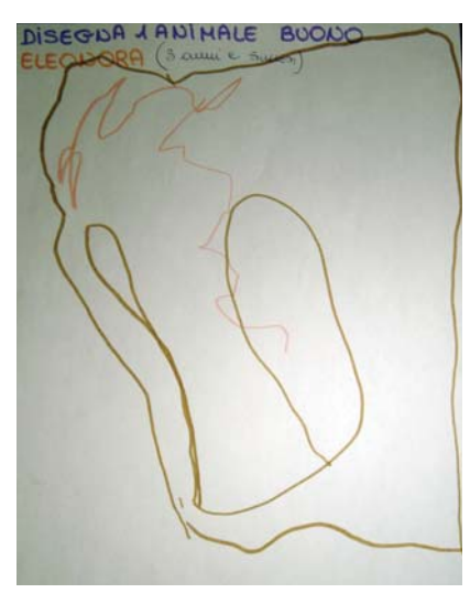
sketch 1: Cat with long whiskers

Eleonora (3 years and 5 months old), when asked to draw a good animal, chose a cat and drew it with an airy and spacious brown line, while imitating the cat's 'miaow'. When asked to explain what she had drawn, she pointed out the orange line similar to the long whiskers of a cat. After identifying a snake as a bad animal, she filled the sheet with jagged lines with acute angles characterized by rapid changes in directions.