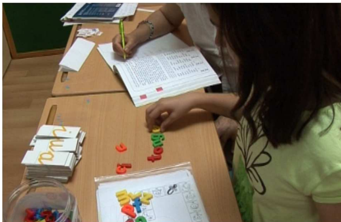
Figure 1. Working with plastic letter to improve GPCR learning.

To achieve automation it is necessary to conduct massive practice, "reading is reading is reading" as expressed by Cossu, Rossini & Marshall (1993). One way to provide massive practice is through repeated reading (Rashotte & Torgesen, 1985; Rasinski, 1990). Hudson, Lane & Pullen (2005) pointed out this method is one of the best ways to develop reading. It consists of reading short paragraphs repeatedly until reaching a certain level of fluency. Then, an equivalent text is presented to achieve widespread progress. It has been found that this method not only improves decoding but also increases reading comprehension. Following Rasinski (2006), the aim of repeated reading should be meaningful and prosodic interpretation of the text, not only faster reading.