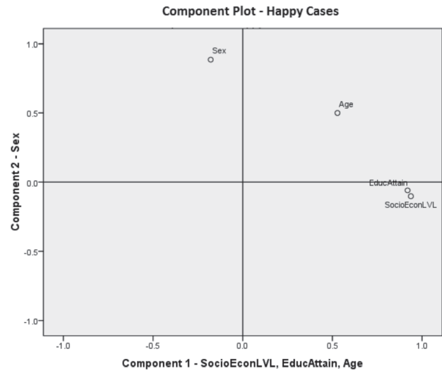
Figure 2. Component plot, happy. The principal component analysis of the socio-demographic variables for the happy cases.

In order to further explore the interactions of the socio-demographic variables and happiness, logistic regressions were used. This kind of analysis is adequate when one tries to explain a dichotomous variable (Hosmer & Lemeshow, 2000). To explore the variables, a backward stepwise model was used, selecting the best model using maximum likelihood. The best model is shown in Table 3, where two variables are considered significant, age (OR=0.879, p=0.033 ) and socioeconomic level (OR=1.218, p=0.042 ).