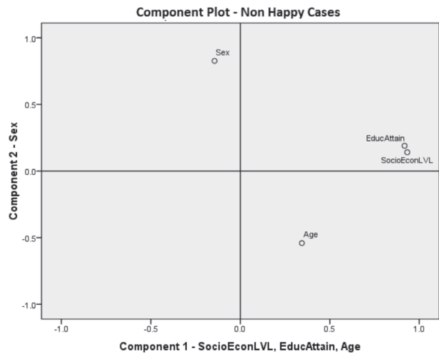
Figure 3. Component plot, non happy. The principal component analysis of the socio-demographic variables for the non happy cases.